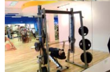
NRG Connection @ City Park Glasgow