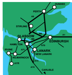
New Lanark (by Lanark) is sign posted from all major routes.

Inside the Visitor Centre, it is easy to imagine how people lived and worked in Owen's day, and you can explore all the attractions easily with one passport ticket. Highlights of any visit include the theatre show Annie McLeod's Story , where the ghost of a 10 year-old mill girl magically returns from 1820, and the New Millennium Experience ride, where you will time-travel with Harmony and discover Owen's vision of a better future. Other award-winning attractions include the Historic Classroom, the Saving New Lanark exhibition, the Interactive Sound & Light Gallery, Working textile machinery, 1820s and 1930s Millworkers' House, Village Store, and Robert Owen's House.