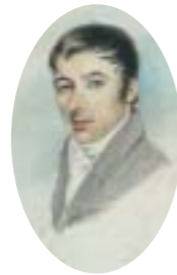
Robert Owen's revolutionary ideas put New Lanark on the world map.

Over 200 years ago the beautiful sandstone cotton mills of New Lanark were founded in a dramatic gorge in Southern Scotland, close to the famous Falls of Clyde. Soon the village became known all over the world because of the work of mill owner and social pioneer Robert Owen. In an age of cruel mill managers and 'dark satanic mills' he provided decent homes, fair wages, free health care, and a new education system for villagers, which included the first nursery school in the world.